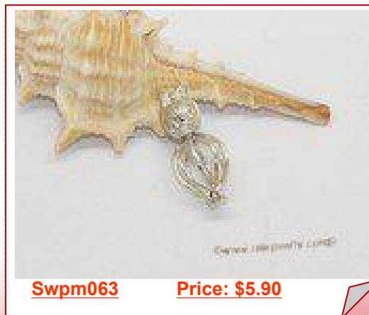
Wholesale Cartoon Duck Design Cage Pendant in Sterling Silver

Wholesales sterling Silver wish pearl cage in Firefighter Tools Design, love pearl cages pendant.