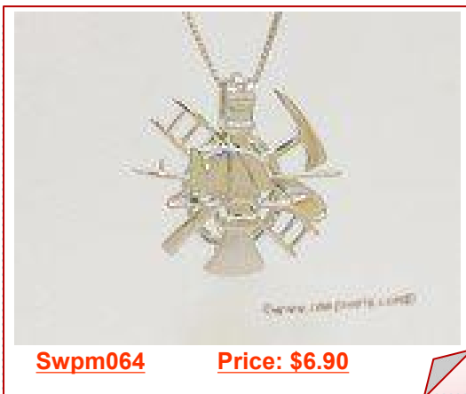
Wholesale Firefighter Tools Design Cage Pendant in Sterling Silver

Wholesales 925 Silver wish pearl cage pendants, love pearl cages pendant, In addition you can order our oyster pearls with round pearl in cans to make wish pearl necklace.