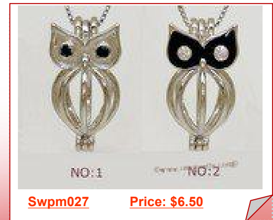
Sterling Silver Owl Wish Pearl Cage Pendant

Wholesales sterling Silver wish pearl cage in Cartoon Duck Design, love pearl cages pendant.