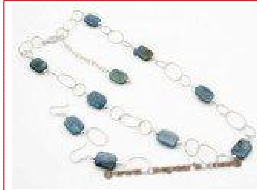
pnset349 Price: $30.90

Fresh look white cultured pearl and gemstone Jewelry set feature hand-matched 7-8mm white potato shape pearls alternated with 5mm turquoise beads and silver tone beads, fastens with a secure silver tone lobster clasps;