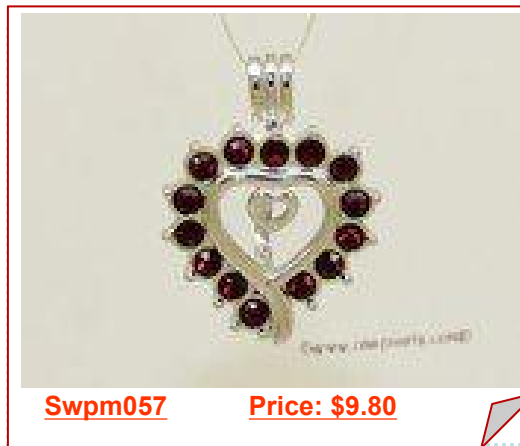
Wholesale Red Gemstone Heart Shape Cage Pendant in Sterling Silver

Wholesales Sterling Silver wish pearl cages at discount price, can combine them with oyster pearls in cans to make wish pearl necklace jewelry set.