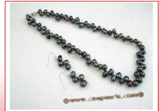
pnset196 Price: $6.80

Stylish summer jewelry set consist of an 16inch necklace, and an 7.5inch bracelet; this modern necklace set specially designed with 8-9mm white and red freshwater blister pearl alternated with 6mm black agate beads