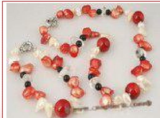
pnset256 Price: $8.30

This white freshwater cultured pearl jewelry set will take her from daytime to evening with ease. We've hand-strung 7.5-inch pearl bracelet with an 18-inch pearl strand. Each piece is finished with a 8mm silver plated ball clasp.