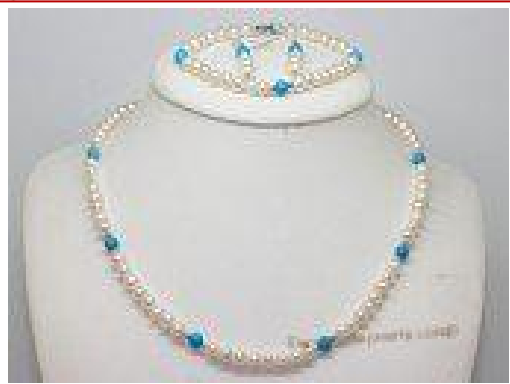
Pnset743 Price: $11.10