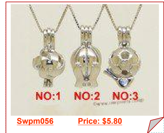
Sterling silver Wish pearl pendants (cages) wholesale

Wholesales sterling Silver wish pearl cage in heart shape with red man made gemstone, love pearl cages pendant.