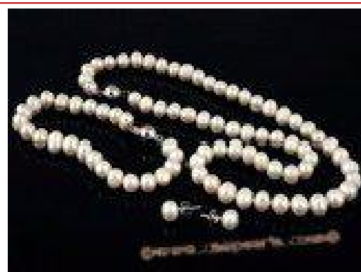
Pnset230 Price: $12.70

Elegant blue gemstone are splashed throughout the design of this beautiful jewelry set, 6-7mm white freshwater potato pearl interspersed with 10*14mm square blue gemstone beads and silver spacer fittings;