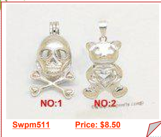
Sterling silver Skull/Pig Wish pearl pendants (cages) wholesale

Wholesales Sterling Silver wish pearl cages at discount price, can combine them with oyster pearls in cans to make wish pearl necklace jewelry set.