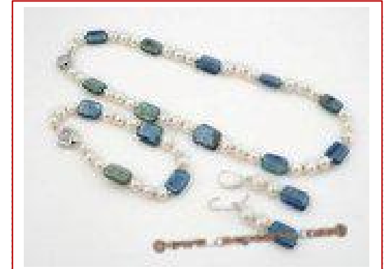
Pnset348 Price: $16.10

This smart and stylish gemstone necklace made design with 10*14mm square gemstone beads connected by oval links of Sterling silver.